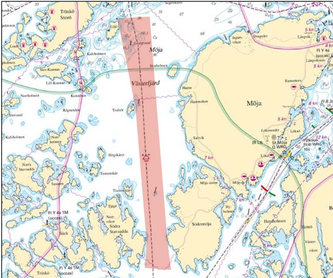
Ice-breaking prohibited Möja Västerfjärd

BSP Stockholm M 2022/s19, Bsp Stockholm N 2022/s40, s45